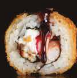
Cosmo Roll 209 mxn Inside, octopus, shrimp, cream cheese and eel. breaded and bathed in eel sauce on the outside.