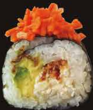
● Pacha Roll 179 mxn Tofu, humus, fried onion, avocado inside Marinated carrot on top.