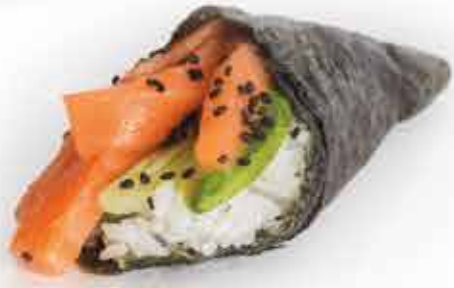
Sake .....98 mxn