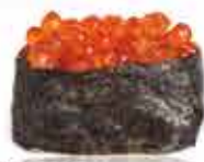
Ikura 72 mxn