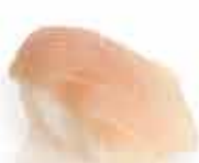
Hamachi 68 mxn