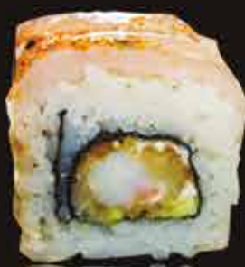
● Encevichado 189 mxn Breaded shrimp, cheese and avocado. Grouped fish outside and encevichada sauce.