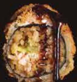
Nico 198 mxn Fried rice, Tampico and avocado inside. Cream cheese, breaded shrimp and eel sauce outside.