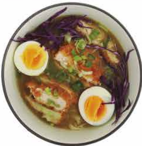
Ramen with curry

Traditional base broth with noodles, spinach, wakame, egg, chives, mushrooms, egg, naruto, and seasoned salmon $229