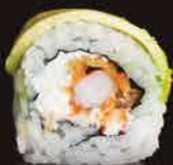
● Roiz 179 mxn Breaded shrimp, Tampico, cream cheese inside and avocado outside.