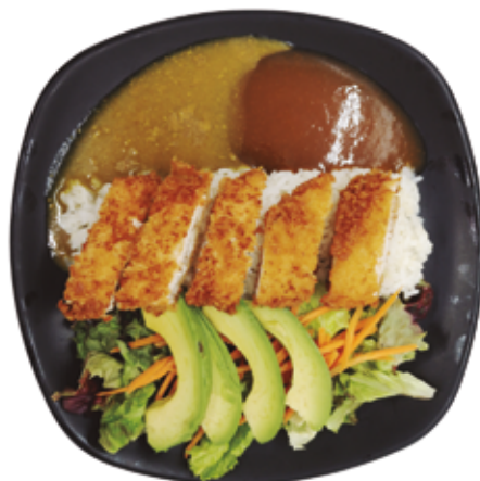
Chicken or pork Katsu

Breaded sushi balls stuffed with shrimp, cream cheese, avocado with chipotle dressing, eel sauce, and alfalfa seed on top.