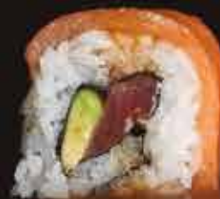
Samba Salmon 219 mxn Salmon covered with ponzu spicy sauce outside. Spicy Tuna and avocado inside.