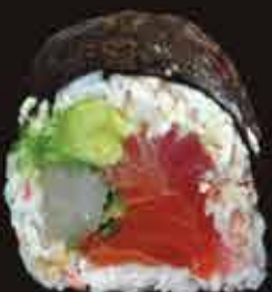
Playacar Roll 228 mxn Roll without rice. With sea weed outside, filled of Tampico, avocado, mazago, with a mixture of sesame oil and hamachi. Salmon, tuna and scallions accompanied with ponzu yuzu sauce.