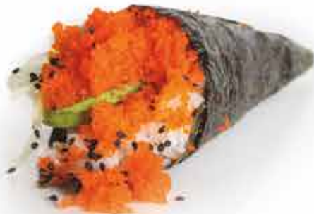
Masago ..... 78 mxn