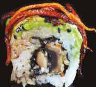
● Florescia Roll 179 mxn Fried sweet potato, tofu and mushroom Baffiered inside and outside Avocado and fried sweet potato bathed with teriyaki sauce and sesame.