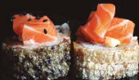
Salmón Skin 198 mxn Inside cream cheese and avocado, outside salmon skin, mayonnaise mazago and salmon.

TUESDAY & THURSDAY 2 ROLLS X $ 229 MARKED WITH ● RED DOT