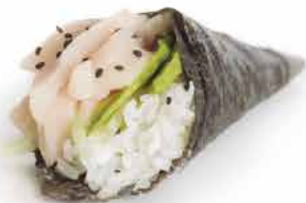
Hamachi ....118 mxn