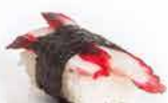
Tako 52 mxn