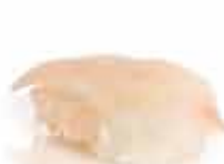
Tai 45 mxn