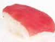
Maguro 58 mxn