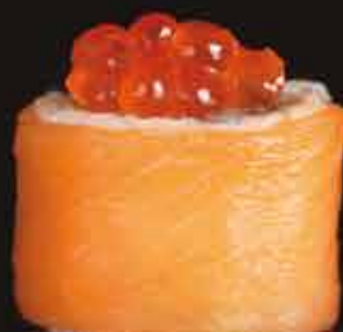
Orange Roll 269 mxn Crab, shrimp, avocado, and cream cheese inside. Salmon with inure outside.