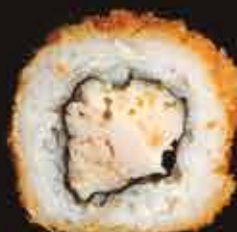
● Chicken Cosmo 179 mxn Fried chicken and manchego cheese, breaded outside with eel sauce.