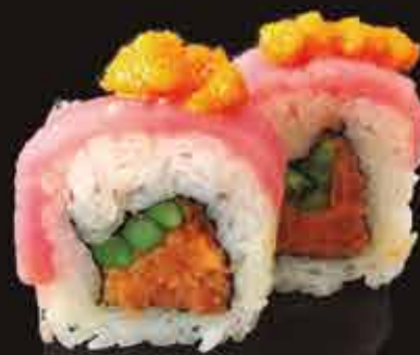
Colorado Roll 209 mxn Inside: Asparagus and spicy tuna On the outside: tuna, mazago and spicy sauce