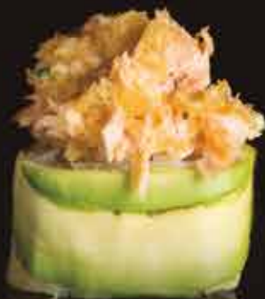
Salmón Crunch 219 mxn Baked salmon with baby onion, green hot pepper and mayonnaise crunch special inside. Avocado outside.