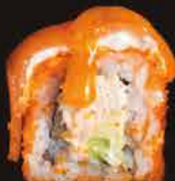
Pico Roll 219 mxn Inside tamponico and avocado. On the outside mazago, cream cheese and salmon bathed in seasoning Chipotle with mango.