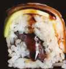
● Ipanema Roll 189 mxn Spicy tuna inside, shrimp and avocado outside, bathed with eel sauce.