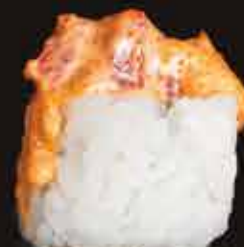
● Spicy Tuna Roll 189 mxn Inside tamponico. On the outside chopped tuna with spicy sauce and masago.