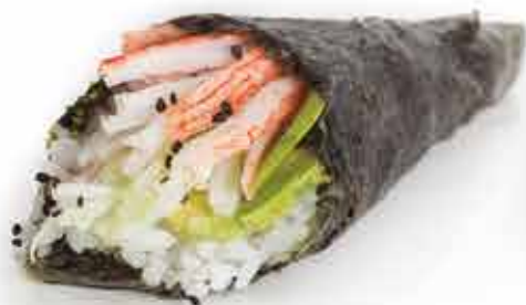
Kanikama .. 78 mxn