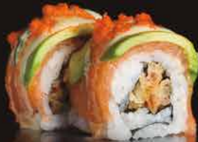
Mazago 198 mxn Fried kanikama inside. On the outside spicy salmon, avocado and mazago bathed in wasabi sauce.