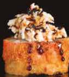
● Maiz 179 mxn Crab, avocado, cream cheese inside. Crab outside, breaded, with Tampico on top and eel sauce.