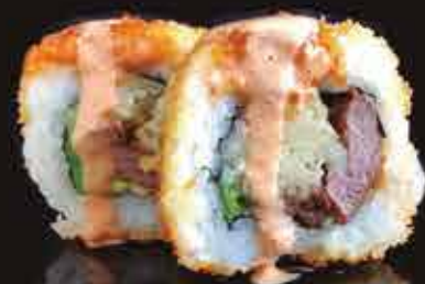
Cosmo filete 198 mxn Breaded roll with filet, avocado manchego cheese inside and chipotle dressing outside.

Not valid in holidays and special dates. Restrictions apply.