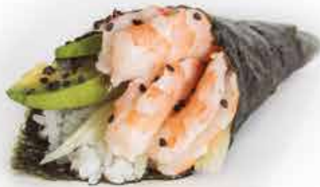
Ebi ..... 82 mxn