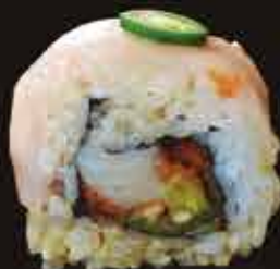
Hamachi Especial 269 mxn Hamachi, mazago and avocado inside, with hamachi fine layers and Serrano outside.