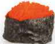
Mazago 52 mxn