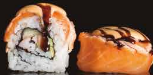
Spicy Salmón 198 mxn Kanikama, avocado and cucumber inside. Sealed salmon outside, bathed with eel sauce, spicy sambal, scallions and black sesame.