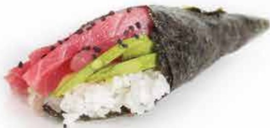
Maguro ..... 92 mxn