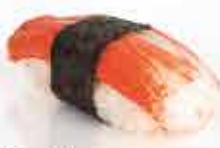
Kanikama 48 mxn