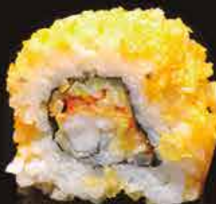
● Crunchy roll 179 mxn Tempura shrimp, cucumber and hot spice dressing inside. Mazago and crunchy special outside.