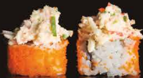
● Dinamita 189 mxn Tempura shrimp, avocado, cream cheese and chipotle inside. Tampico paste and rezago outside.