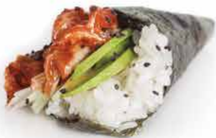
Unagui ..... 118 mxn