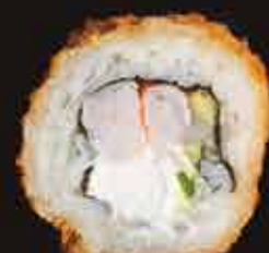
● Shrimp Cosmo 179 mxn Shrimp, cream cheese and avocado inside. Breaded and with eel sauce on the top.