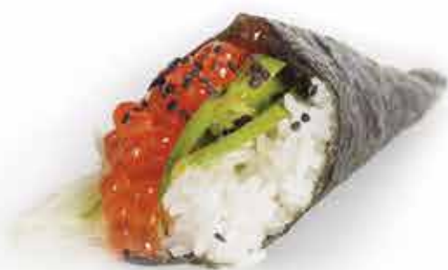
Ikura .....118 mxn