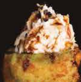
Tricolor 189 mxn Breaded shrimp, cream cheese inside. Breaded with Tampico, avocado and eel sauce outside.