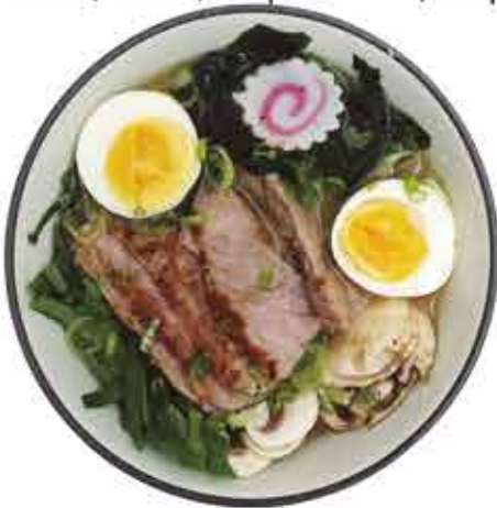
Beef Steak Ramen

Traditional base broth with noodles, spinach, wakame, chives, mushrooms, egg, naruto, and weathered shrimp. $229