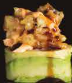
● Kani Krunch 189 mxn Crab paste roll and cream cheese inside. Covered with avocado, crunchy kanikama with mayonnaise and scallions bathed with eel sauce with spicy sambal.