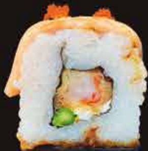
Rive Roll 189 mxn Baked roll, inside cream cheese, asparagus and breaded shrimp. Outside salmon and mazago topped with eel and chipotle sauce.