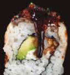
Unagui Mazago 228 mxn Breaded shrimp, cream cheese and avocado inside. Eel, scallions and mazago outside.