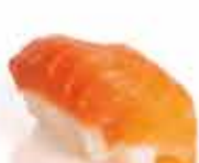
Sake 58 mxn